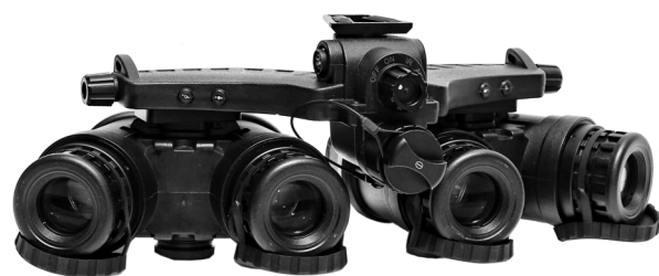
IMAGE INTENSIFIER TUBES