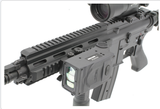
Mounted on Assault Rifle with visible LCD Display