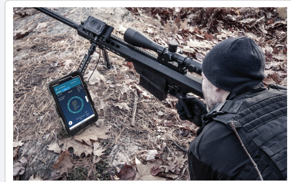
Seeker M mounted on a sniper rifle with a connection to Android™ Compatible Tablet, using NC Cronus™ app.

The SEEKER M is a specially designed multi-purpose mountable laser rangefinder which can be a vital tool for various operations. This device can be mounted and aligned with any optical system including weapon sights and can be integrated with various purpose built platforms. The device incorporates the newest laser ranging technologies to help the operator not only seek the target, but also, based on compass and inclinometer indications.