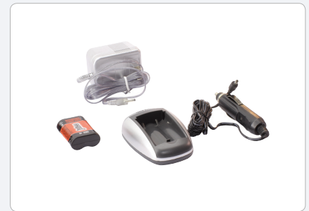
LRB 6/12K Rechargeable Kit