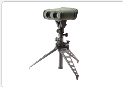
NC SST3-3S Tripod