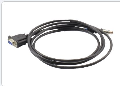
LRF GPS Cable