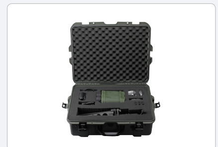
Hard Case with Optional Accessories