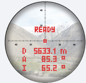
LRB 6K - Display

The LRB 6K is built to outperform any handheld laser rangefinder binocular available today. Packing a virtually endless set of performance features into a MIL-SPEC form factor, the LRB 6K can handle anything professional operators can throw its way. A 6,000 metre (NATO target) measuring range, built-in digital magnetic compass, and a crystal-clear LED display are combined into an invaluable force multiplier. The LRB 6K requires virtually no maintenance and very little operational training. Through USB, Bluetooth and RS-232 interfaces, the LRB 6K can be operated remotely, have its stored data exported, and communicate with external GPS systems and ballistic computers (only with Bluetooth installed).