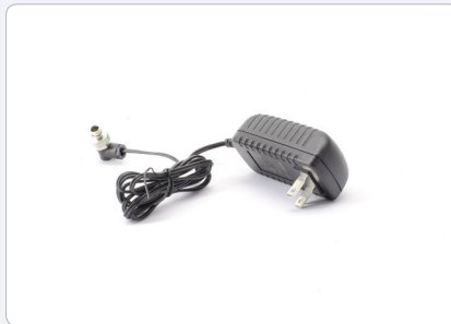
LRF AC/DC Adapter