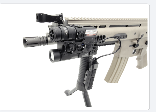
Mounted on Scar rifle